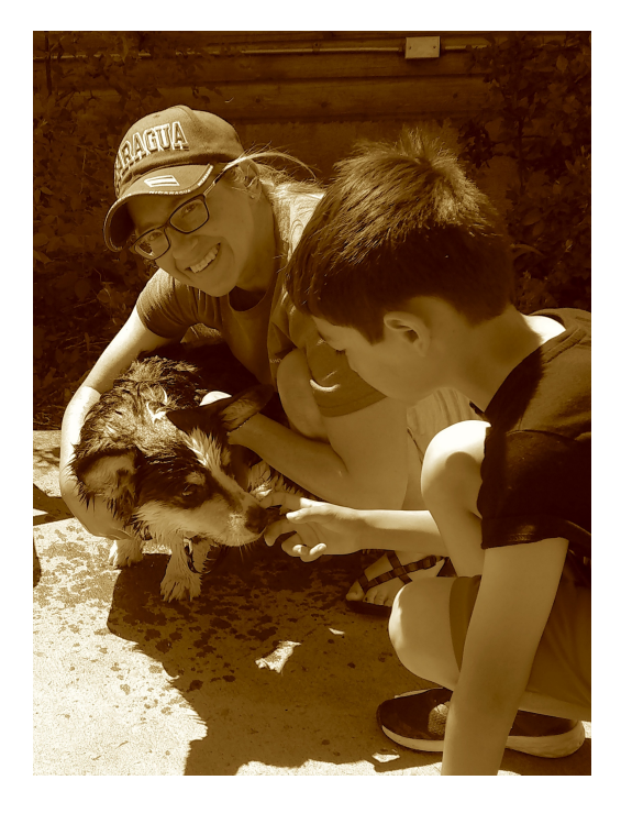
Treats convince the hesitant ones