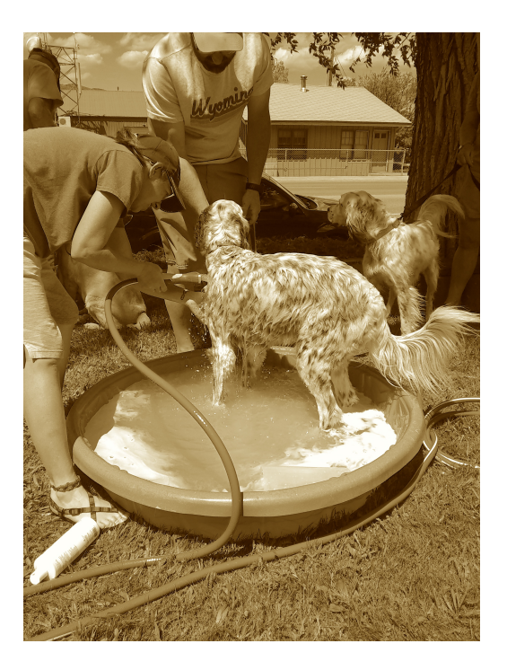
The dogs enjoy the water on a hot day

WFCHS held three Dog Washes this summer, which were well attended, and enjoyed by all including the canine visitors despite some initial reluctance on the part of a few dogs, which soon disappeared with the help of treats. These are usually held on the lawn of St. Thomas Episcopal Church.