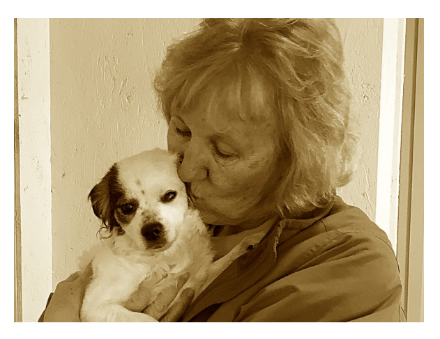
Holly finds a loving home

Here are just some of the happy endings that WFCHS helped facilitate for pets who found their forever homes this year!